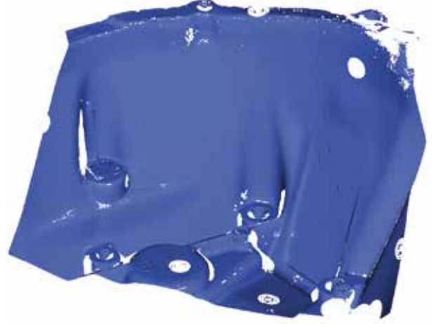
3D scan made with a blue light filter