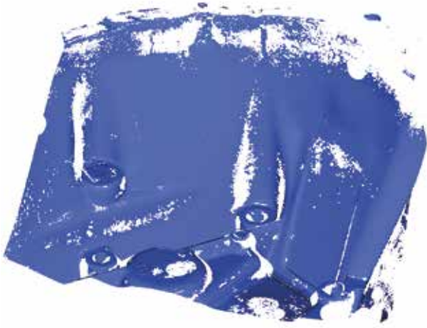
3D scan made without a filter