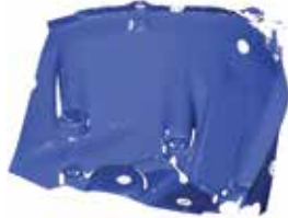
3D scan made with a filter