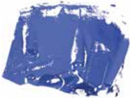
3D scan made without a filter

High intensity of blue light and higher exposure on cameras causes great results of scanning process even dark and shiny surfaces.