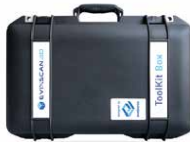
ToolKit Box MAX