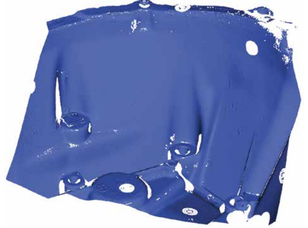
3D scan made with a blue light filter