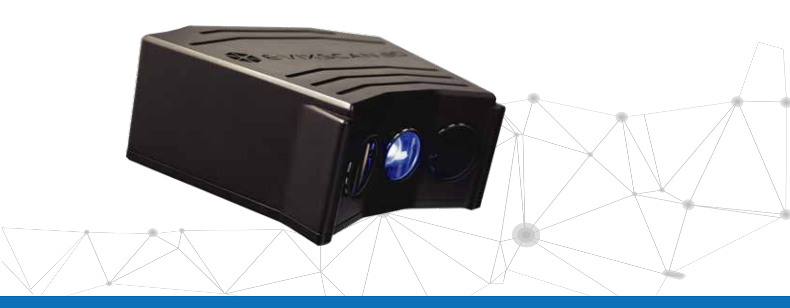
Precision 3D scanning of the smallest objects